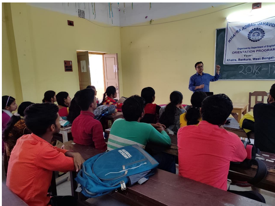
Image 4: Student Orientation Programme for newly admitted students