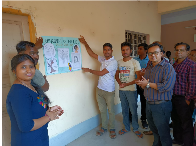
Image 2: Wall Magazine, Muse 2018-2019