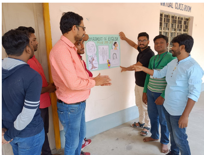
Image 1: Displaying English Department Wall Magazine, Muse 2018-2019

The English Department of Khatra Adibasi Mahavidyalaya proudly presented its annual wall magazine titled “Muse 2018-19”. This magazine was a collaborative effort of the students, showcasing a rich tapestry of sketches, poems, write-ups, and insightful discussions centered around women's issues and gender sensitization, with a particular emphasis on the safety of women in society and their significant contributions. "Muse 2018-19" served as a platform for the students to express their thoughts, ideas, and creativity while addressing pertinent social issues, aimed to raise awareness, provoke thought, and foster dialogue on topics related to women's empowerment and gender equality. “Muse 2018-19” exemplified the commitment of the English Department at Khatra Adibasi Mahavidyalaya to engage students in meaningful discourse and empower them to become flag bearers of positive change. Through art, literature, and advocacy, the wall magazine embodied the spirit of resilience, solidarity, and hope, inspiring all who encountered it to strive for a more just and equitable world.